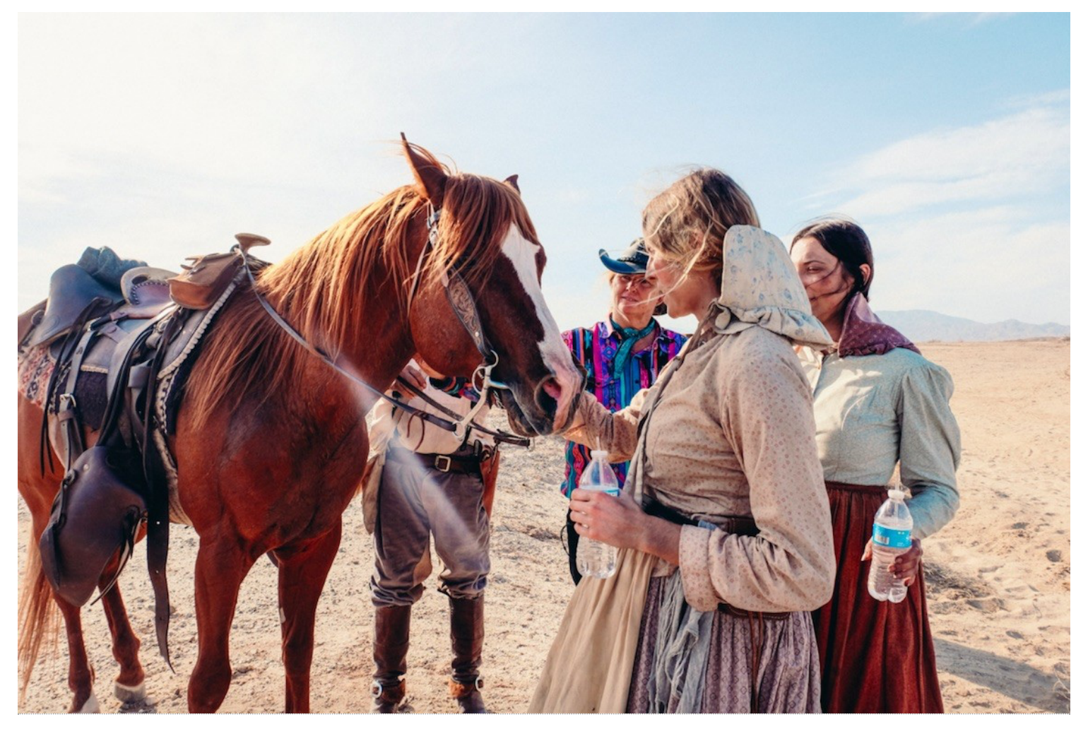
A still from short film 'Pioneers' directed by all-woman collective SLMBR PRTY, a recipient of the SHIFT Creative Fund.