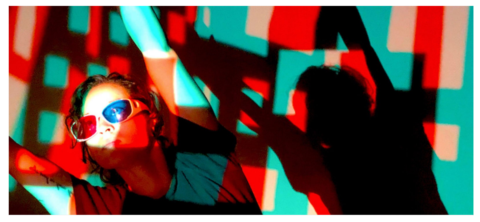
Captured from the Sundance New Frontier program, whose corresponding Lab is now open.